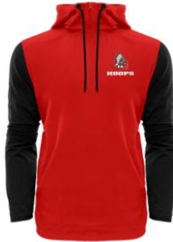
X26 L/S Quarter Zip (Unisex)