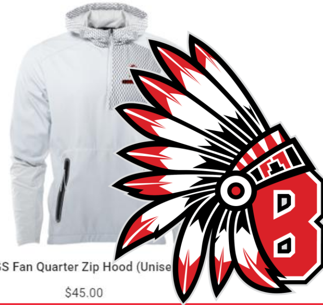
XGS Fan Quarter Zip Hood (Unisex)