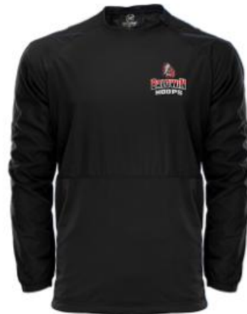
X22 Long Sleeve Pullover (Unisex)