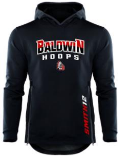
XGS9 Hoodie (Unisex)