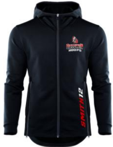
XGS9 Full Zip (Unisex)